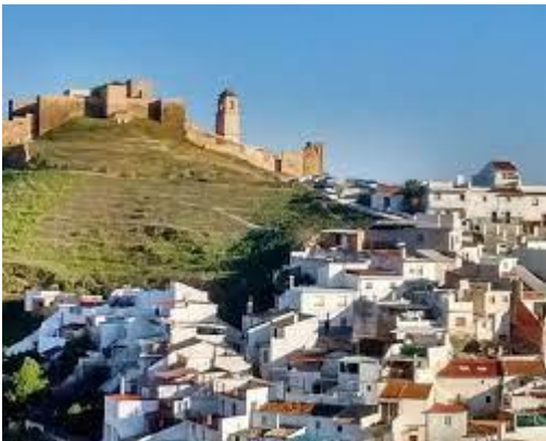
Castle of Álora

Location: Málaga province, Spain. Town of: Álora