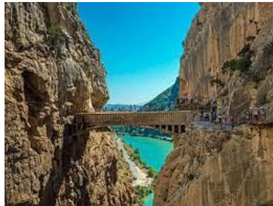
Caminito del Rey-El chorro