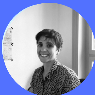
LUCIE YOUTH COORDINATOR