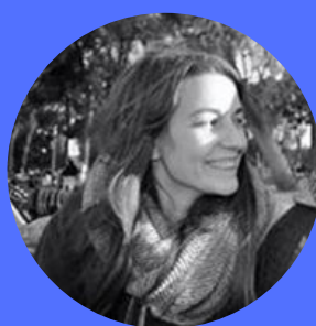
EMMA COORDINATOR EDUCATION TO GLOBAL CITIZENSHIP